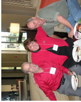
Teams from congregations learning and growing together.

Through this project and others (i.e., Turn-Around Congregations, Transformational Ministry) at least fifty percent of the congregations in the Grand Canyon Synod will be defined as Great Commission congregations by 2014.