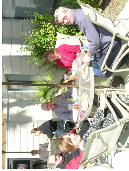
Missional Leadership Academy Class of 2011 relaxes during retreat.

Augsburg Fortress, Minneapolis MN California Lutheran University, Thousand Oaks CA Evangelical Lutheran Church in America, Chicago IL Luther Seminary, St. Paul MN Pacific Lutheran Theological Seminary, Berkeley CA Spirit in the Desert Retreat Center, Carefree AZ Thrivent Financial for Lutherans Minneapolis, MN/Appleton, WI